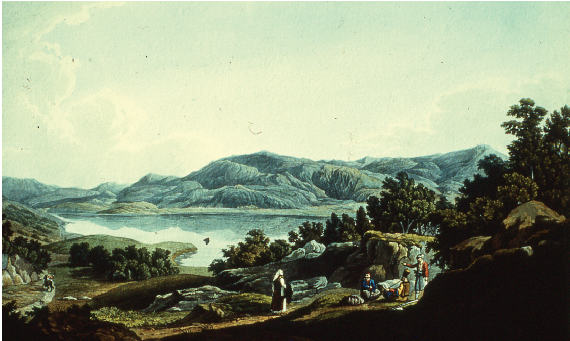
Pl. 1.1 Aquatint by E. Dodwell of Stymphalos