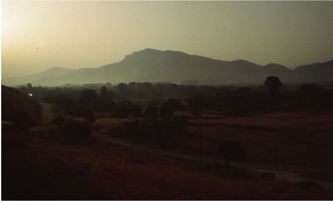
Pl. 1.2 Corresponding landscape from which the painting was made